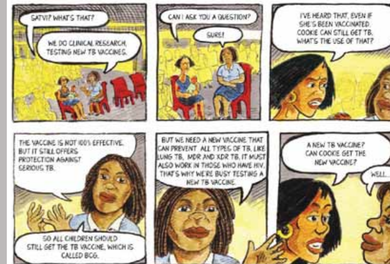
SATVI comic funded by Stop TB Partnership/WHO