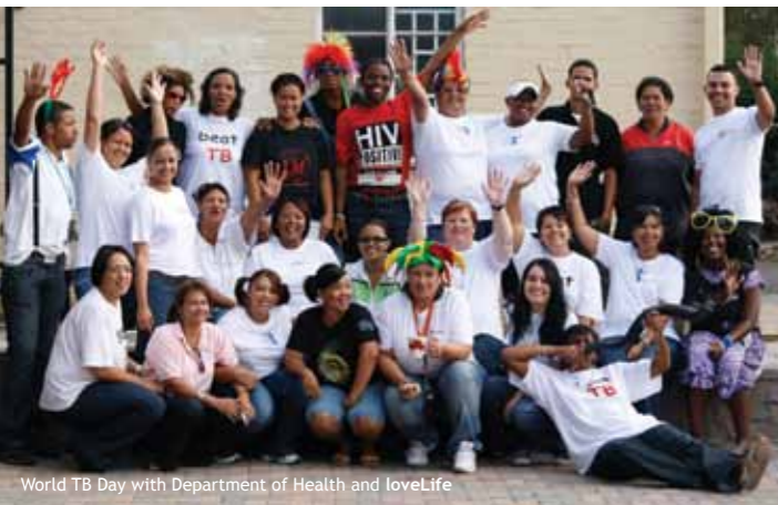
World TB Day with Department of Health and LoveLife