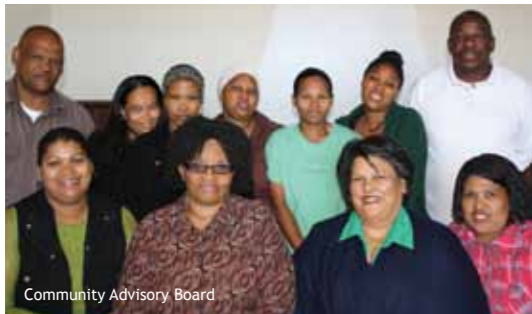
Community Advisory Board